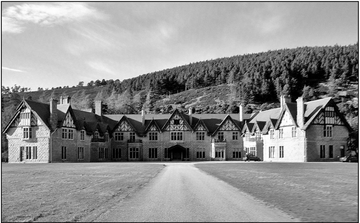
3rd Mar Lodge 2015

The 3rd Mar Lodge was built between 1895 and 1898 for Alexander Duff, the 1st Duke of Fife and his wife Princess Louise, Princess Royal and Duchess of Fife. The foundation stone was laid by the Duchess' grandmother, Queen Victoria on 15 October 1895.