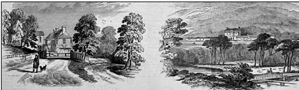
Left Corriemulzie Cottage - Right 2nd Mar Lodge 1848 (Illust. London News)

The first, originally known as Dalmore House, was built in the 18th century by William Duff, Baron Braco, (family later became Earl Fife) close to the site of the present Lodge. Lord Braco had acquired the Dalmore estate sometime between 1730 and 1737, and by the end of the 18th century the Duff family also owned the lands of Allanaquoich, Auchindryne and Inverey. The building was damaged in the 'Muckle Spate' (great flood) of 1829, and later demolished.