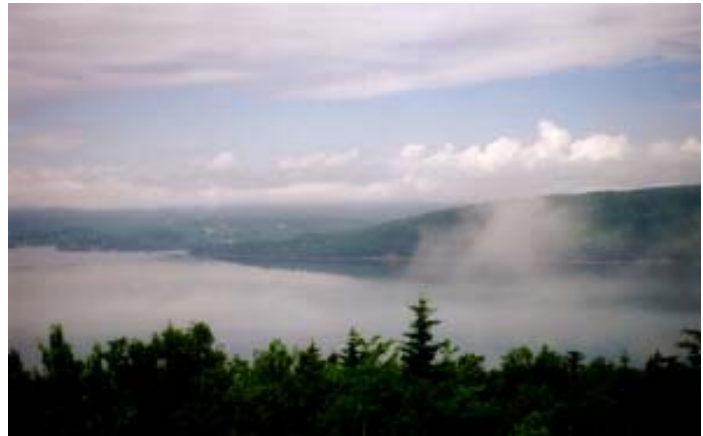
Lake Bras d'Or