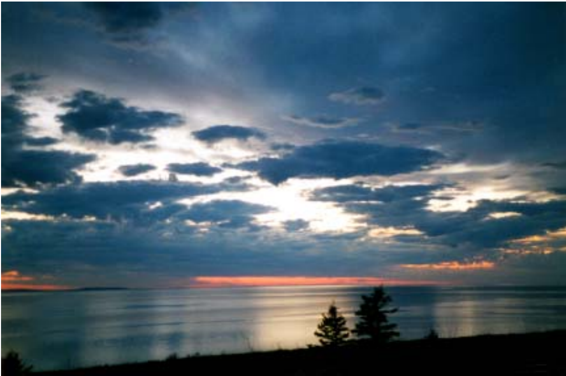
Lake Bras d'Or